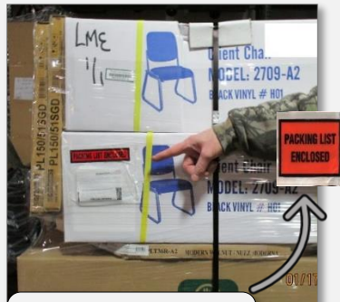
BOL will be in a plastic envelope on pallet