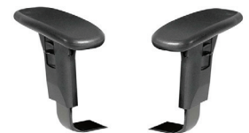
311AK – Optional, Height + Width Adjustable Arm Kit