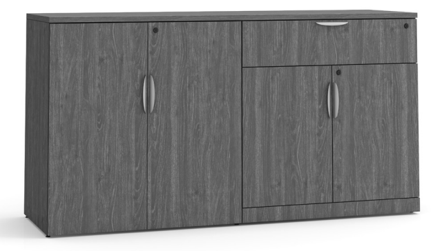
Shown on top of a PL113 next to a PL152.