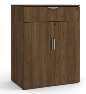
Shown on top of a PL152