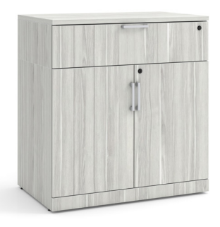
Shown on top of a PL113